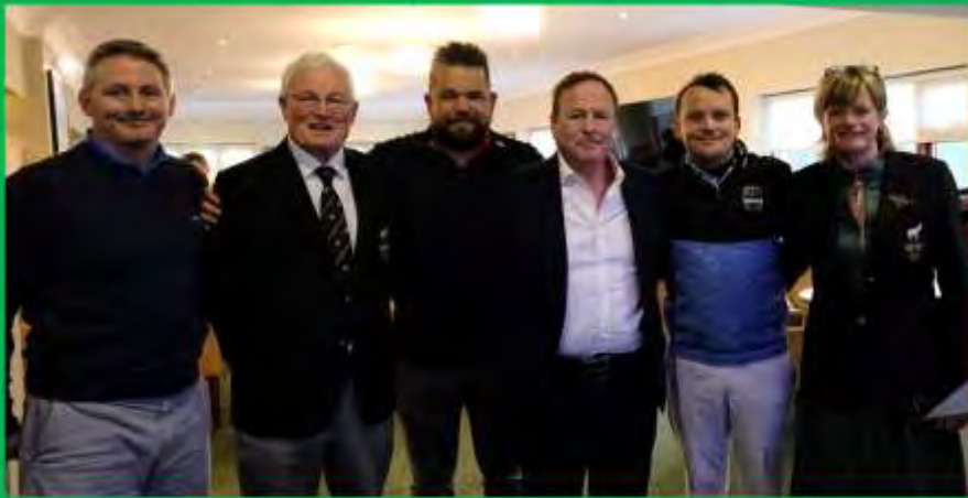
2022 'Captains Drive In Scramble' Winning team