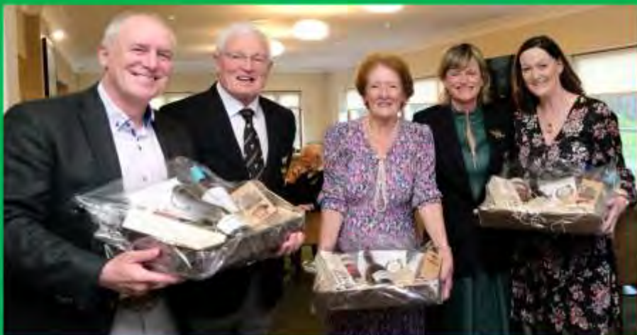
2022 'Captains Drive In Scramble' Runners up