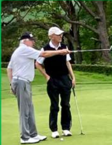
Reading the line....