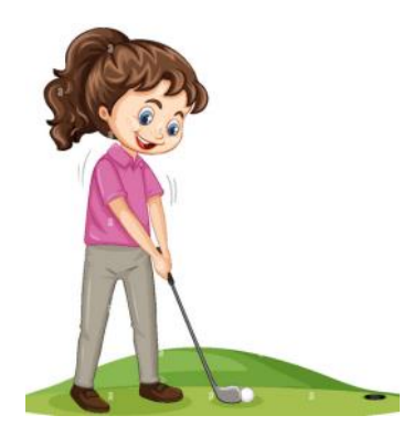
Delgany National School, Delgany