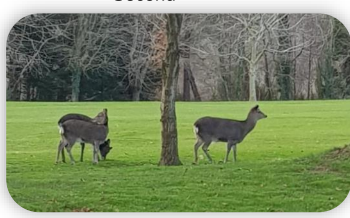
The three deer who joined us for the shotgun !!!