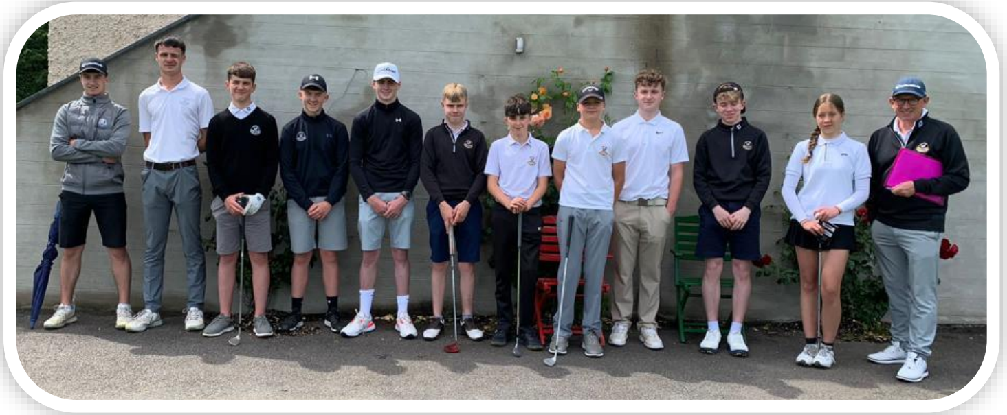
Our Junior players for the Wicklow Cup match