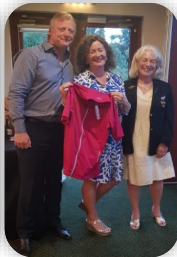
4 th Place Maura MacKeogh (not pictured)