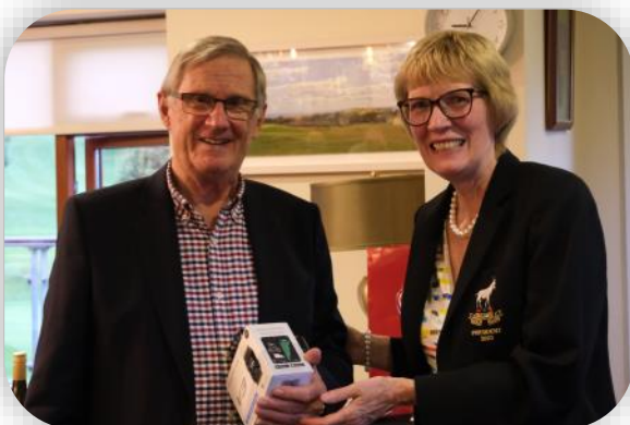
5 Day Winner-