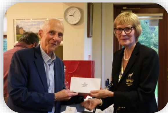
5 Day runner up