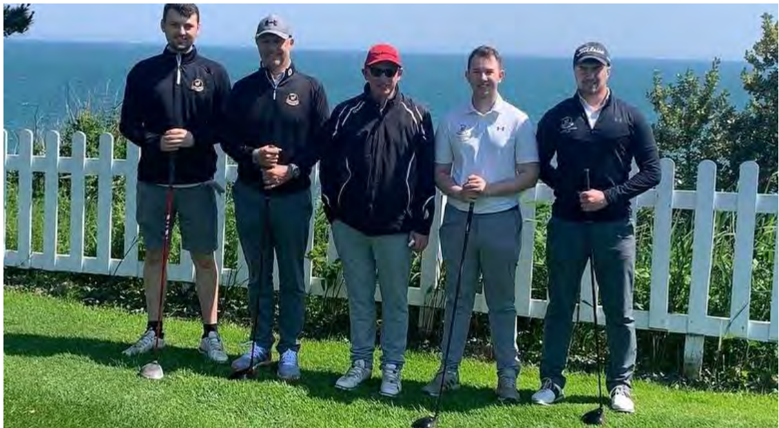
Metropolitan Cup team Vs Dun Laoghaire GC