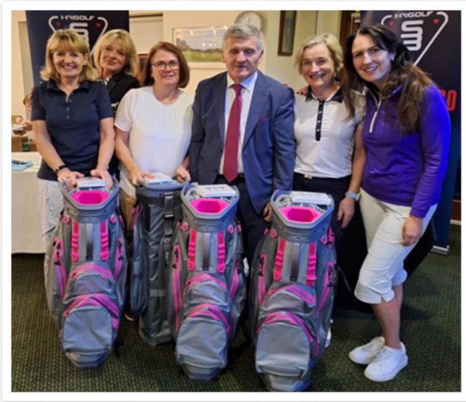
18 Hole Competition Winners